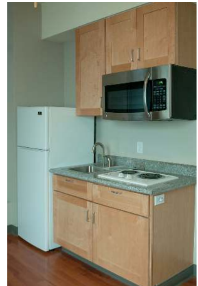
In-unit kitchenette.