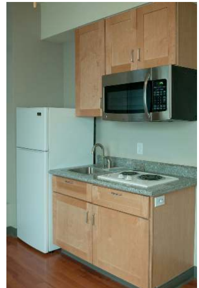
In-unit kitchenette.